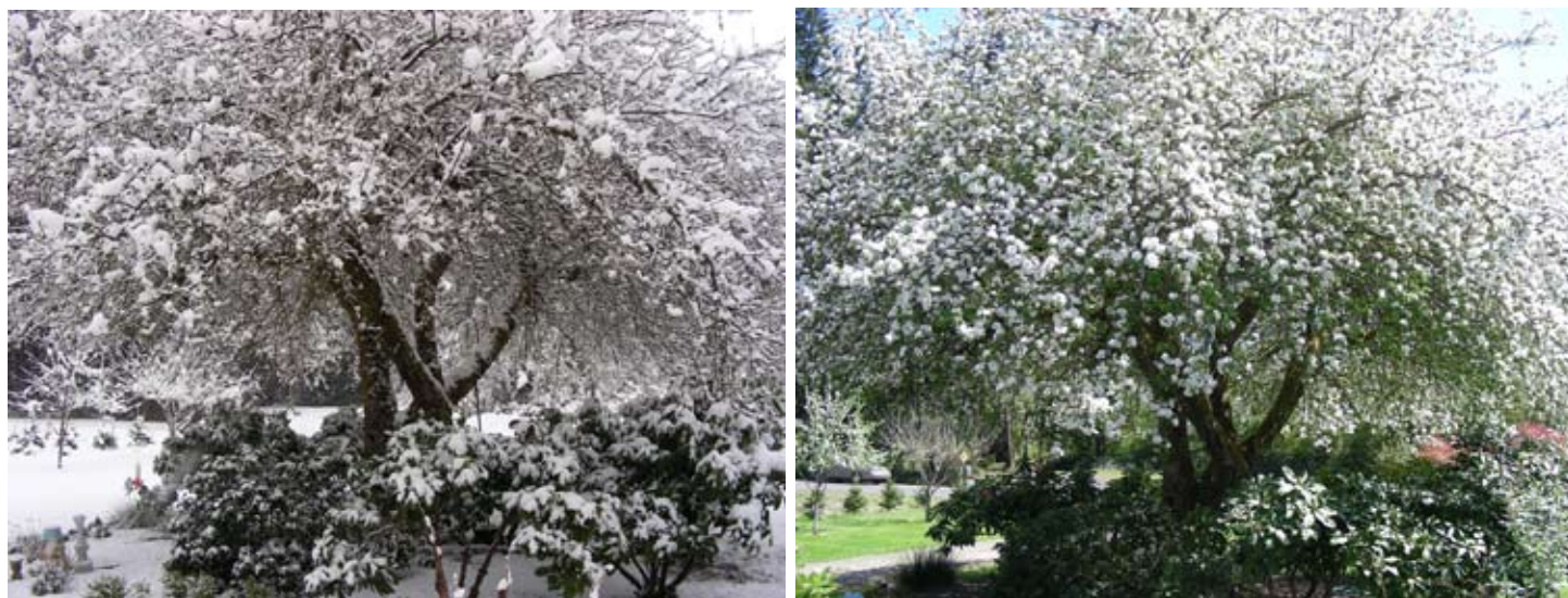
The photo on the left was taken on April 19, and the photo on the right was taken May 15. Leave it to Western Washington weather to keep us all guessing "what a difference a month makes."